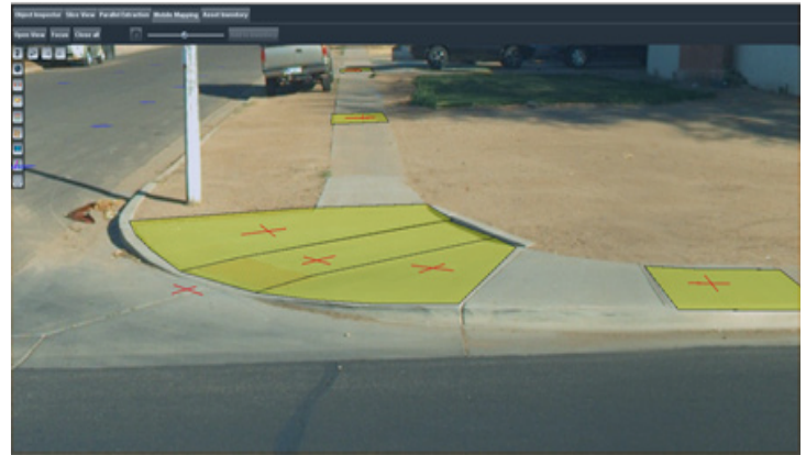
Ramp and Sidewalk features with running slope and cross slope lines.

With the comprehensive data collected, BPG and our partners can tailor reports to fit the specific needs of our clients. While data is crucial to the process, it is not what decisions are based on. BPG and our partners provide the report as information side by side with the relevant standards. This report allows decision makers to quickly discern which attributes are not within standards, while also giving the reader a more thorough understanding of how severe any failure is. BPG goes beyond the data collected by our LiDAR systems. With the help of our partners, we can incorporate additional factors that can affect the severity of issues. Some of these additional factors can include proximity to schools, government buildings, parks, bus stops, and much more. The algorithm used to determine the overall severity of issues can be customized to fit the individuality of community's priorities. An example report is shown below.