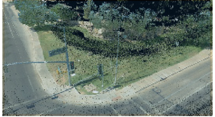
Control Point and Intersection

Another benefit of the technology and software used by BPG is that our analysts can compare the LiDAR cloud side-by-side with panoramic images taken during collection. This allows our analysts to work in the best environment for their task.